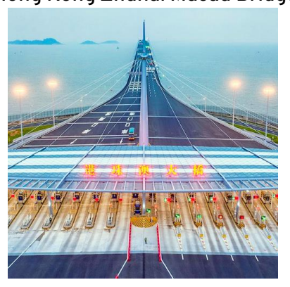
Hong Kong Zhuhai Macau Bridge