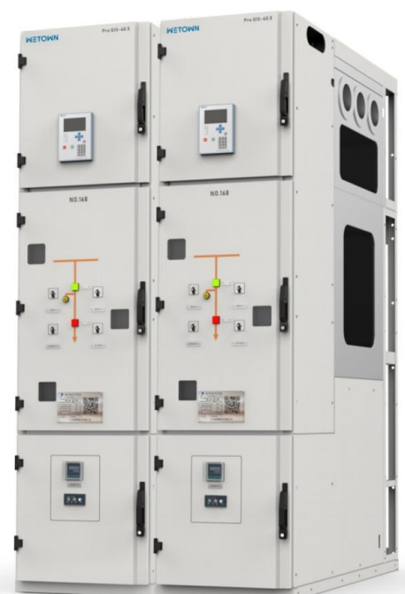
Pro GIS is available for rated voltage 12kV, 24kV, up to 40.5kV installed indoor

The Metal-Clad design provides High reliability, Economy, User-Friendly operation and Safety. The compact design with three-phase enclosure allows very simple construction. In addition, switch components can be removed or added in a very short time without removing the busbar.