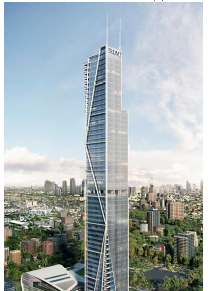
TRUMP Tower - Philippines