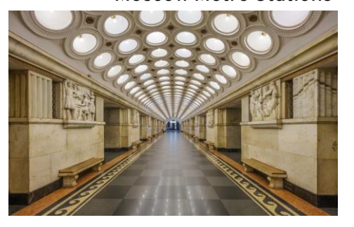
Moscow Metro Stations