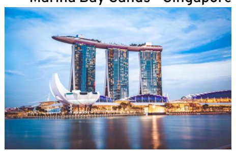
Marina Bay Sands - Singapore